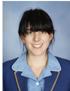
Abigail Gitsham Australian Politics